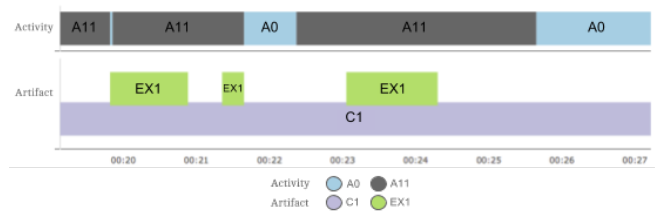
Figure 1: Time sequence of Activities and Artifacts from P1

Using this codeset, the first and the third authors obtained an Inter-Rater Reliability (IRR) score of 97.14% and the first and the fourth authors obtained an IRR score of 92% when coding random